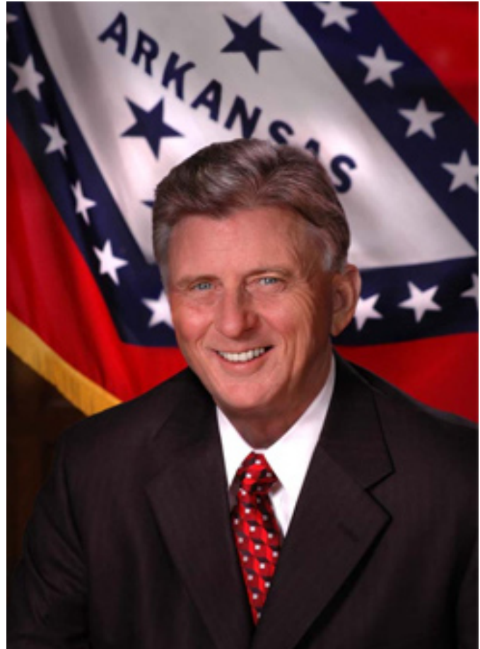
Arkansas Governor Mike Beebe

Students at UALR will benefit in the CollegeCareerCorps® program by receiving both technical and professional skills training while working directly for a professional I.T. services firm at major regional corporations and governments, thus giving them exposure to key leaders in the business community and adding real-world work experience to their resume. Students earn money year round and receive possible credit hours while gaining an inside track to jump-starting a career.